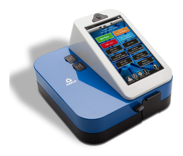
Figure 1 – Orflo's Moxi GO II – Next Generation Flow Cytometer. The Moxi GO II is a configurable flow cytometer with a 488nm laser and up to two fluorescence recording channels (2 PMT's with emission filters at 525/45nm filter and 561nm/LP, respectively).

Cellular apoptosis is a sophisticated mechanism employed by cells to carefully control death in response to cell injury. Commonly referred to as "programmed cell death," apoptosis progresses through a systematic signaling cascade that results in characteristic, directed morphological and biochemical outputs in the cell. The overall outcome is a highly regulated cell death process that minimizes trauma to the cell's extracellular environment. At a systemic level, the critical role of apoptosis is easily highlighted through its hearing implication in cardiovascular failure<sup>2</sup>, cancer neurodegenerative progression<sup>3</sup>. disorders4, and numerous other pathologies<sup>5</sup>. Correspondingly, scientific research has intently focused on revealing