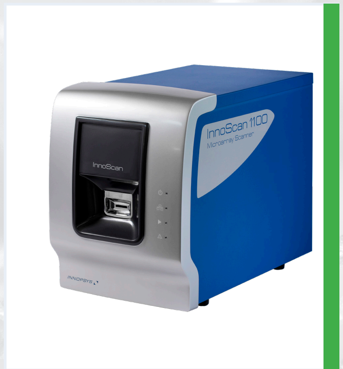
Image acquisition & analysis software

Barcode reader Accurate control of acquired images Scanner supplied with a validation slide which verifies scanner performance